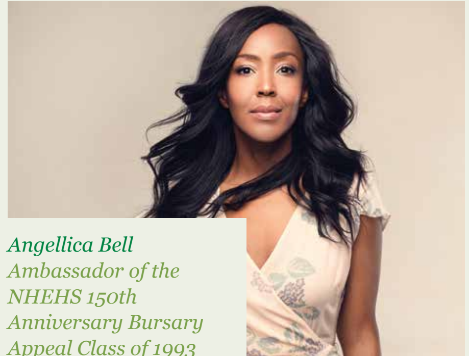
Angellica Bell Ambassador of the NHEHS 150th Anniversary Bursary Appeal Class of 1993

At NHEHS, depending on the size of the award, students will also receive help to meet the cost of their uniform, school lunches, music lessons, travel, (if a child lives more than 3 miles from school), and essential school trips. In the Sixth Form, 100% bursary holders are provided with a laptop, and we fund three university visits as well as the cost of a ticket to the Year 13 Prom. Providing this additional support allows our bursary recipients to make the most of the opportunities offered by the school.