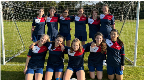
U15 Football team at the GDST Rally