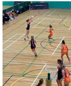
Gen playing for U19 London Pulse team in the NPL