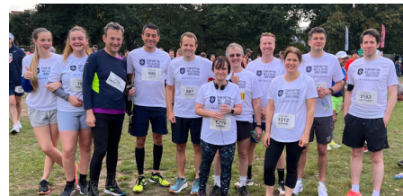
Staff & Students who ran the 2023 Ealing Half Marathon