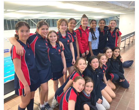
NHEHS swimming squad at the London Heats for Year 7 & 8