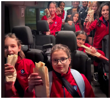
Pizza twists are a favourite after a fixture at St Benedict's