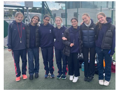
Students who assisted with running a Willow Tree Junior Netball tournament